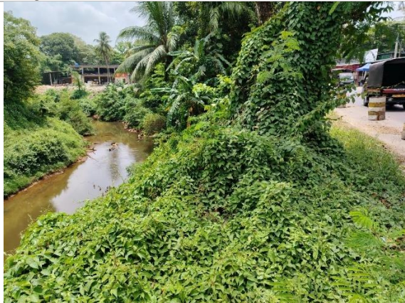
Figure 4d: Damaged section of the road covered with plants