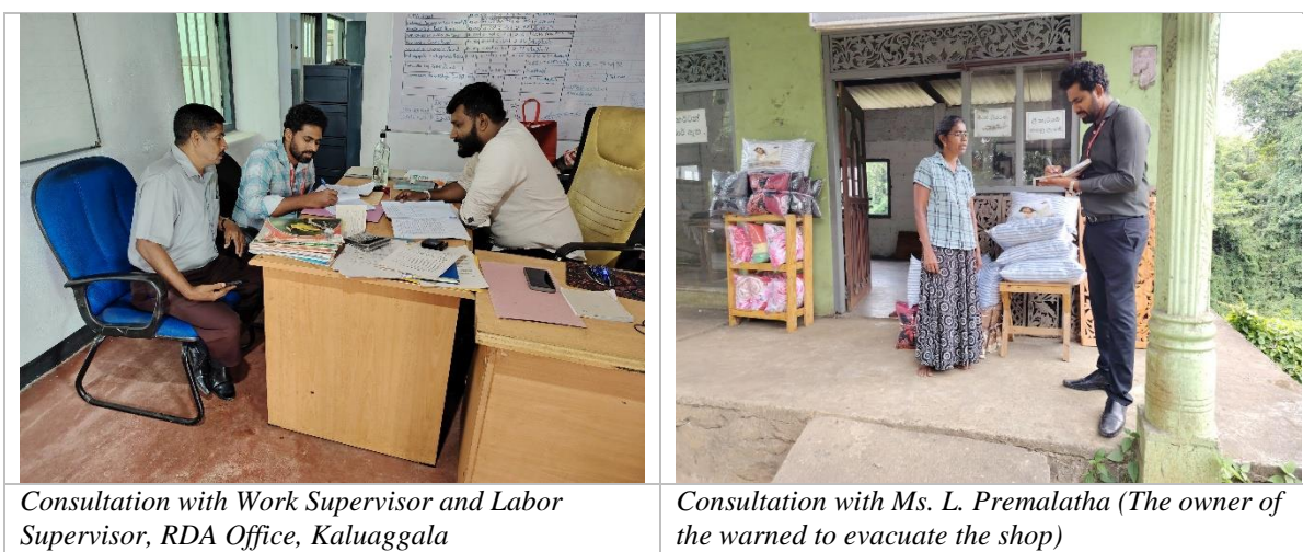
Consultation with Work Supervisor and Labor Supervisor, RDA Office, Kaluaggala