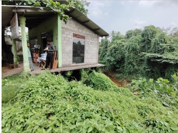
Figure 4b: High risk small shop located near the mitigation site