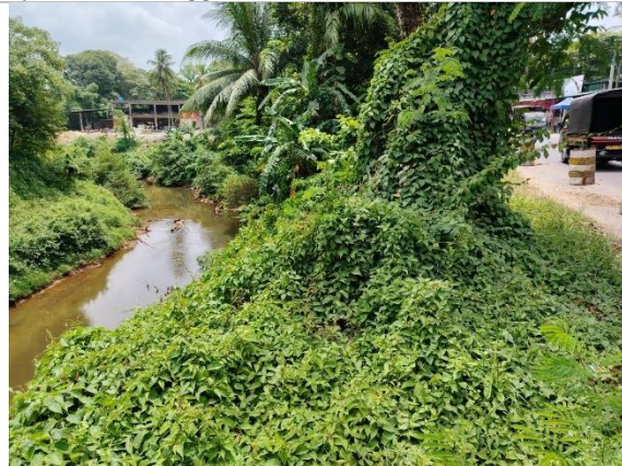
Figure 4c: Wak Oya flowing along the downslope