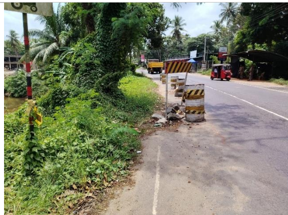
Figure 4e: Barriers by RDA

Figure 4: Sensitive elements that may be affected by the project actions