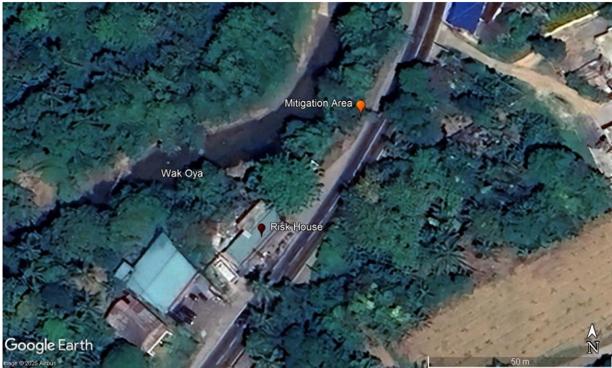
Figure 2: Google image of the proposed slope failure mitigation site, the surrounding environmental features and service infrastructure