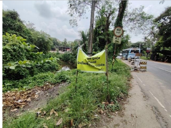
Figure 4a: Damaged section of the road, warning by RDA, Kaluaggala

(Ref. Fig.4: Sensitive elements that may be affected by the project actions)