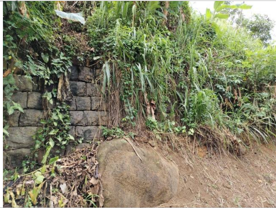
Figure 3g: Damaged retaining wall (Old railway line), deposited rock builders and slope failure front of the Hatton – Avissawella main road (A7)