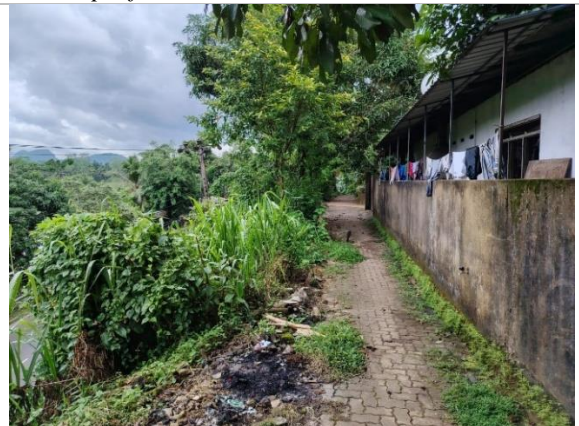
Figure 3d: LHS of the road and Low risk house No:01