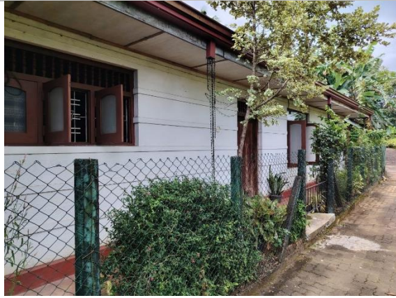
Figure 3e: Low risk house No:02