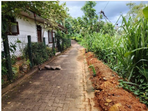
Figure 3c: Sub road parallel to Hatton – Avissawella road (A7), access to Thaldywa Bomaluwa Samurdhi Bank