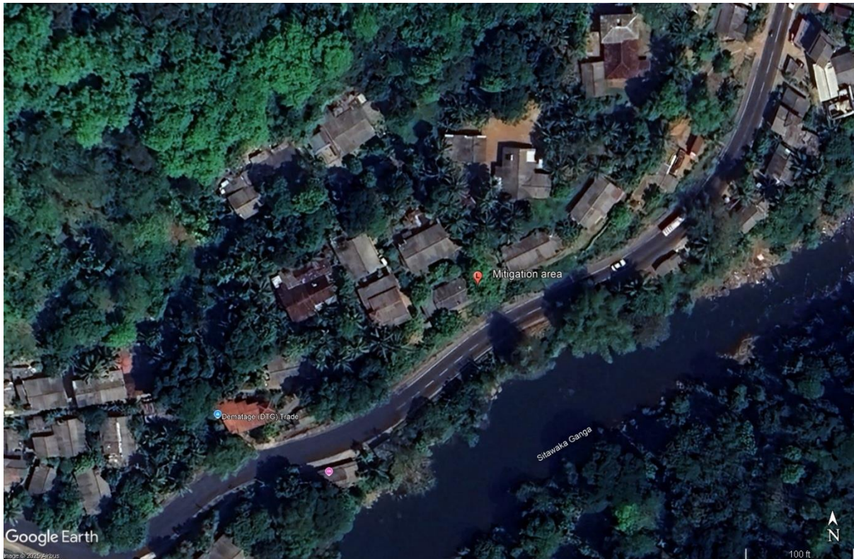
Figure 2: Google image of the proposed rock-fall/ landslide mitigation site, the surrounding environmental features and service infrastructure