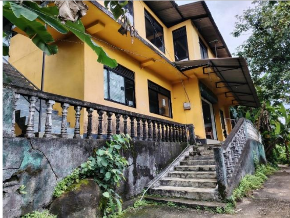
Figure 3a: Thaldywa Bomaluwa Samurdhi Bank (two storied building)

(Ref. Fig.3 Sensitive elements that may be affected by the project actions