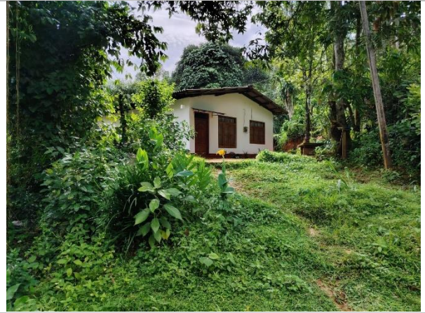
Figure 3f: Low risk house No:03