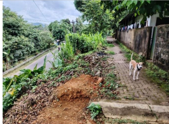
Figure 3b: Downslope near to edge of the sub road with slope failure