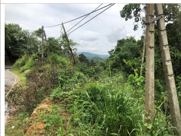
Figure 4c: Risk high tension electricity lines