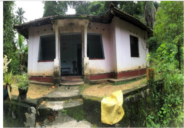
Figure 4f: house located next to the mitigation area