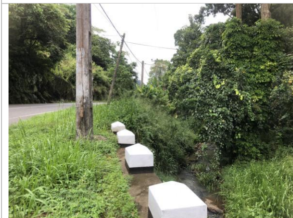
Figure 4g: “Galgediyangala Ela” stream flowing at the downslope