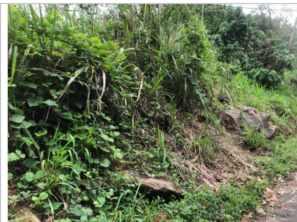
Figure 4a: Downslope area with debris deposit

(Ref. Fig.4 Sensitive elements that may be affected by the project actions)