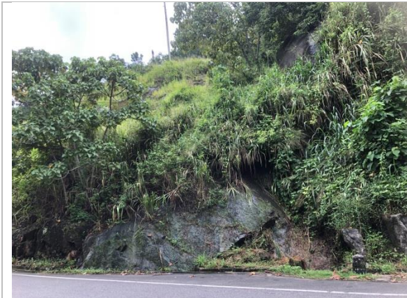
Figure 4e: Unstable rock boulders at the upslope