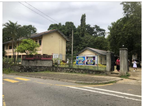
Figure 4h: Dedunupitiya Maha Vidyalaya located near to the mitigation area (towards Hatharaliyadda)