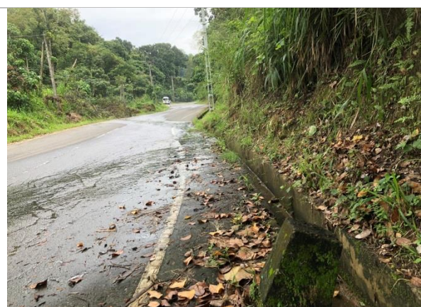
Figure 4d: Damaged road section