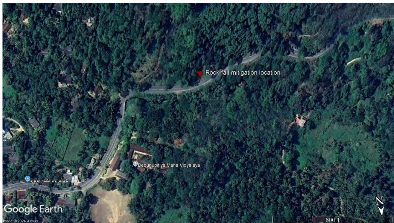
Figure 2: Google image of the proposed landslide mitigation site, the surrounding environmental features and service infrastructure.

Refer figure 2, 3; Google image of the proposed landslide mitigation site, the surrounding environmental features and service infrastructure.