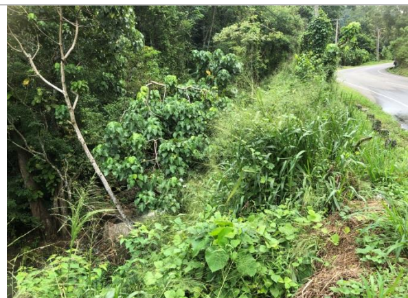
Figure 4b: Downslope area