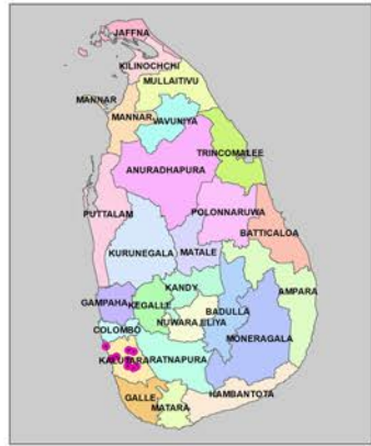
Location with Respect to Sri Lanka

Reduction of Landslide Vulnerability by Mitigation Measures Project (RLVMMP)